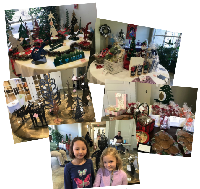
Our best shoppers!

Lovers of creative gifts and sweet treats turned out at Southminster for the second annual Crossroads Winter Bazaar fundraiser, Dec. 6-8. Seasonal and everyday metal works from the ever-popular Garden Deva disappeared, as did baskets and gift cards from local businesses, including Stonebrook Day Spa, NobiliTea, Sushi Hana, and Ti Amo. Bedlam-themed confections from Bedré Chocolate and ginger cardamom cookies baked by Yours Truly also fared well. The fact that on one day we competed with the Big 12 Championship Game (OU 30, Baylor 23 in OT) did not deter a good number of people from helping Crossroads and taking home some cool loot in return. A pleasant surprise was a quarter-page ad for the Bazaar in The Tulsa Voice , donated by its parent company (and our wonderful friends!) Langdon Publishing.